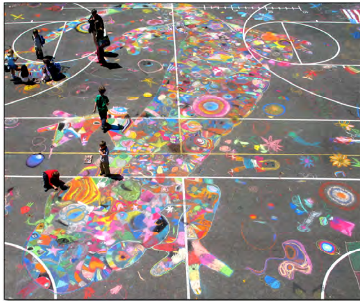
Chalk Drawing at Franklin Elementary School 2006

We are also launching our non-profit "Re-Enchanting the World Through Art" whose mission is to support and inspire kid's creativity and imagination locally, and around the World.